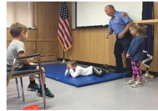
STOP, DROP, ROLL