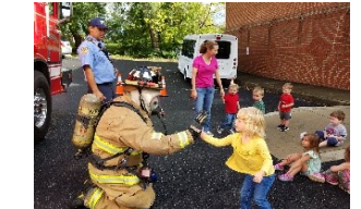
He's not so scary, after all!