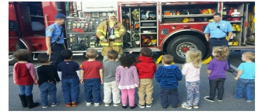
Special visitors for the Butterflies & Bluebirds